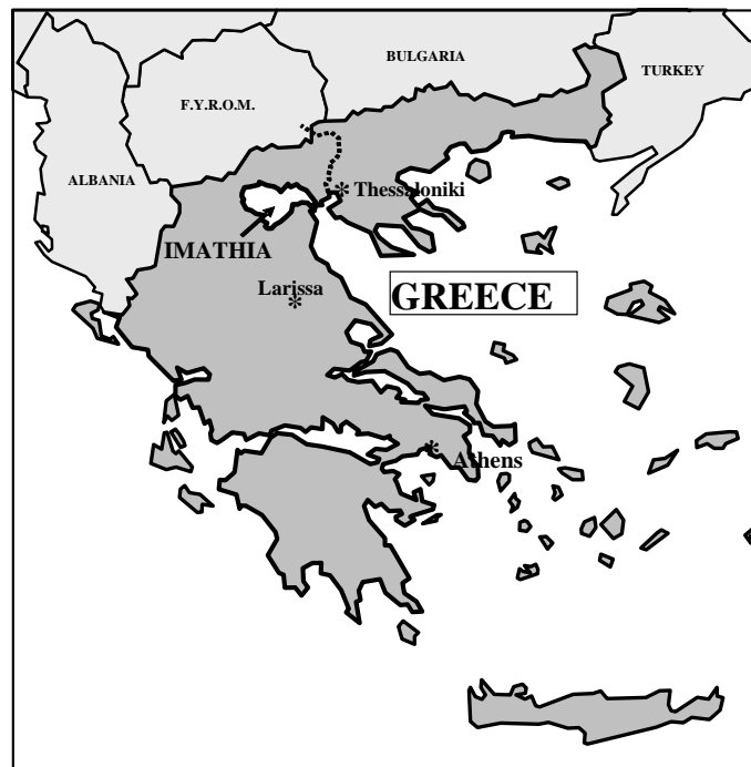
Figure 1. Simplified map of Greece depicting the study area.

The Prefecture of Imathia covers an area of about 1700 km 2 and is located between 21° 53' – 22° 42' E and 40° 17' – 40° 44' N, in Central Macedonia, Greece (Figure 1). Cultivated lowland occupies 46% area of the region, being composed of forests and rangeland. Intensive agriculture is practised on an area of 510 km 2 ; most crops are irrigated either by flood irrigation or by sprinklers. Drip irrigation accounts for only 4% of the irrigated land, but this practice shows an increasing trend. Peach ( Prunus persica ) (36%), pear ( Pirus communis ) (5%) and apple trees ( Pirus malus ) (4%) are the main irrigated perennial crops of the region. The dominant annual crops are cotton ( Gossypium hirsutum L.) 35%, corn ( Zea mays L.) 11% and sugar beet ( Beta vulgaris L.) 3%, whereas rainfed winter wheat ( Triticum aestivum L.) occupies 15% of the arable land. About 82% of irrigation demands in the lowlands are covered by surface water via a dense collective network, and the remaining 18% are supplied from groundwater.